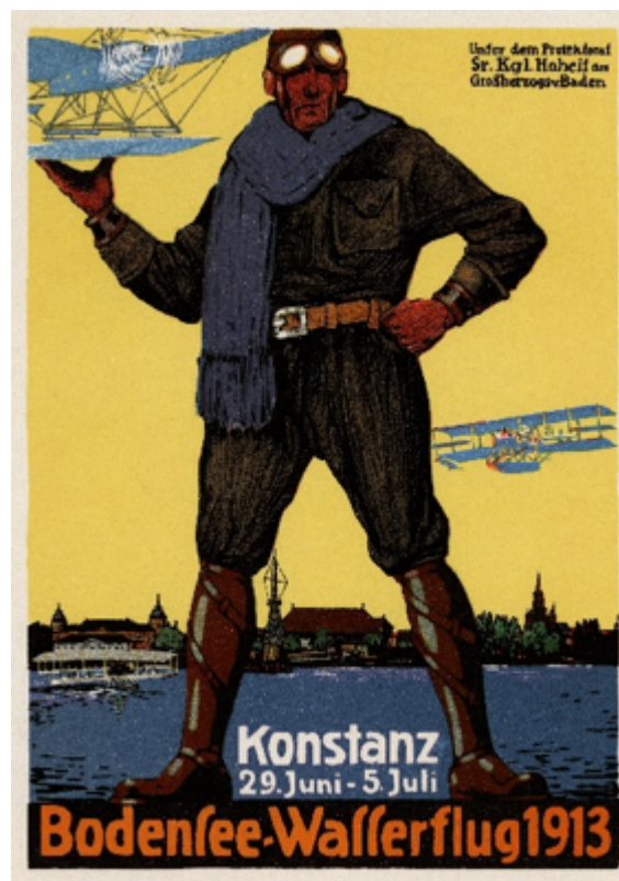
Fig. 1. Bodensee-Wasserflug 1913

“Bodensee-Wasserflug 1913”, reproduced in facsimile in Plakat gedanke und kunst (Stuttgart: Propaganda Stuttgart, 1912), 20, https://jstor.org/stable/10.2307/community.29391751 .