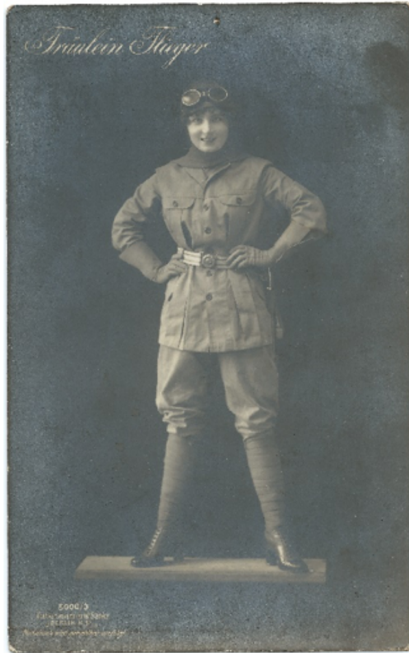
Postkartenvertrieb Willi Sanke, “Fräulein Flieger”, 5000/3, Berlin, ca.1918.