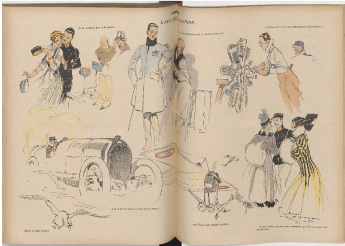
Fig. 5. The aviator portrayed by René Vincent in late 1915

R. Vincent, "L'Aviateur inspire...", La Baïonnette , 23 (16 December 1915), 376-377, https://gallica.bnf.fr/ark:/12148/bpt6k6580711t/f8