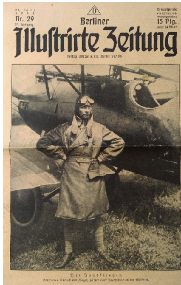
Bayerisches Hauptstaatsarchiv, Kriegsarchiv, Munich, MMJO V K 18/12, Berliner Illustrierte Zeitung , 21 July 1918.