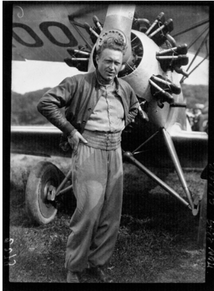
Fig. 4. Gerhard Fieseler

Bibliothèque nationale de France, Mondial, 2279, The German Fieseler, 4 June 1932, http://catalogue.bnf.fr/ark:/12148/cb41599162b .