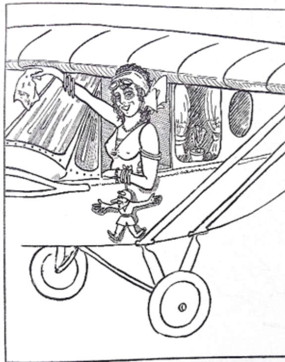
Fig. 7 and 8: Caricatures of a transport pilot and the American aviatrix Ruth Elder drawn by the German aviator Ernst Udet in 1928