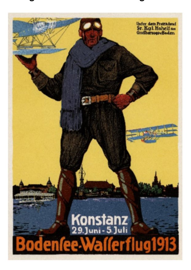
Fig. 1. Bodensee-Wasserflug 1913