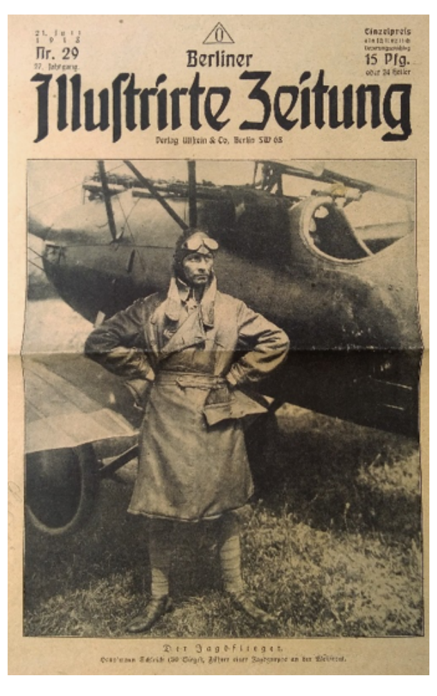
Fig. 2. Eduard Schleich

Bayerisches Hauptstaatsarchiv, Kriegsarchiv, Munich, MMJO V K 18/12, Berliner Illustrirte Zeitung, 21 July 1918.