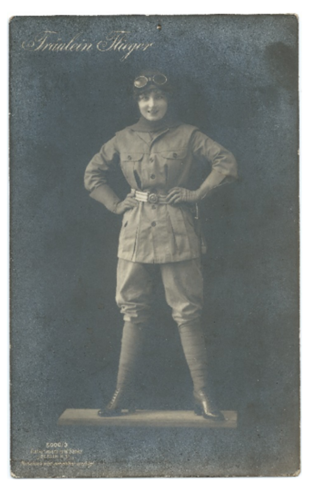
Fig. 3. German Postcard "Fräulein Flieger"

Postkartenvertrieb Willi Sanke, "Fräulein Flieger", 5000/3, Berlin, ca.1918.