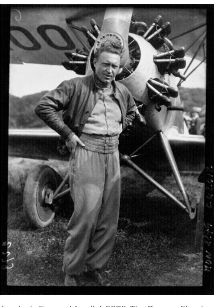
Fig. 4. Gerhard Fieseler

Bibliothèque nationale de France, Mondial, 2279, The German Fieseler, 4 June 1932, <a href="https://exatalogue.bnf.fr/ark:/12148/cb41599162b">https://exatalogue.bnf.fr/ark:/12148/cb41599162b</a>.