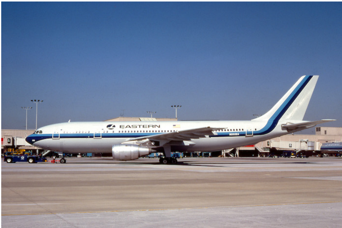
Fig. 4. Eastern Airlines Airbus A300B on the runway at Miami International Airport in 1983