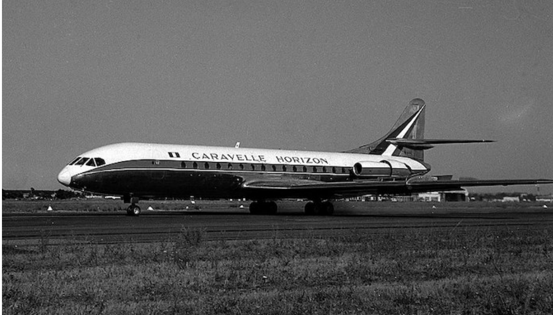
Fig. 2. The Caravelle “Horizon” intended for the American market. Its first run on the Blagnac runways on 28 August 1962