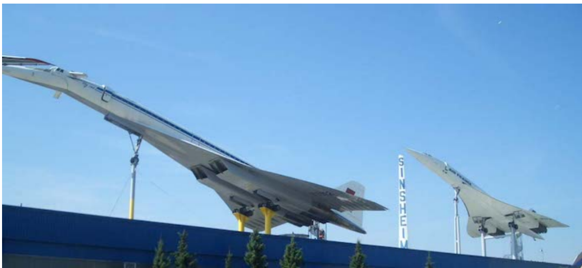
Fig. 3. Automotive and Technology Museum in Sinsheim (Germany), the only place where a Tupolev TU-144 and a Concorde are kept side by side